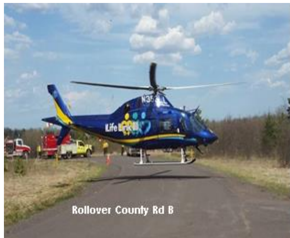
Rollover County Rd B