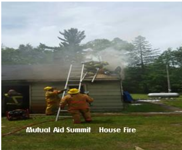
Mutual Aid Summit House Fire