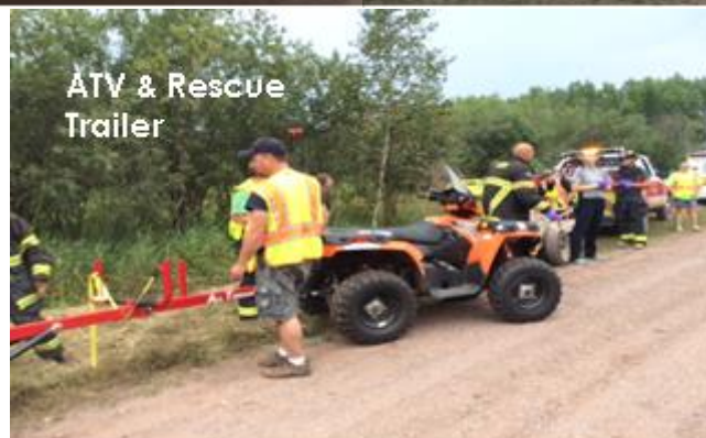
ATV & Rescue Trailer