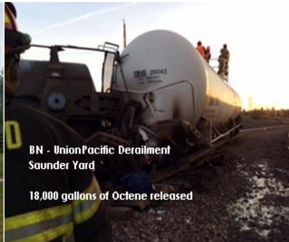
BN - Union Pacific Derailment Saunders Yard