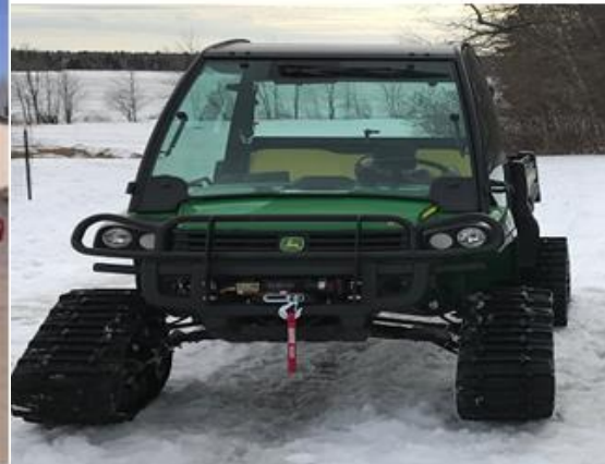
John Deer Gator 825 50 gallon tank pump pt carrier