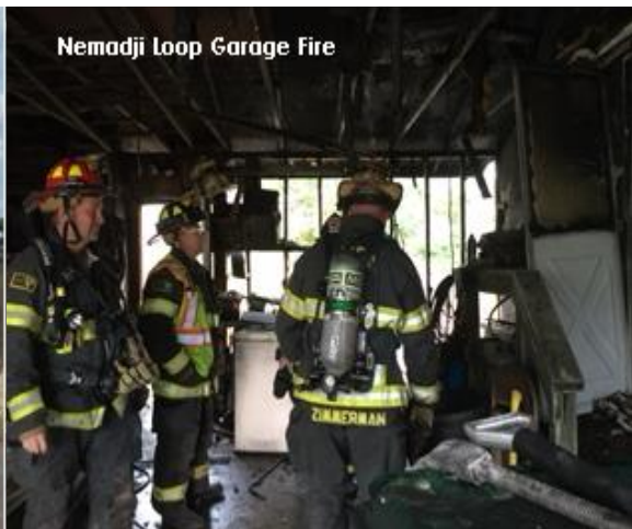
Nemadji Loop Garage Fire