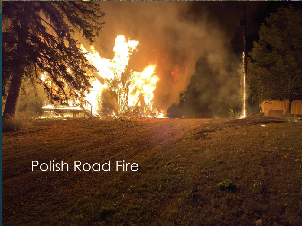
Polish Road Fire