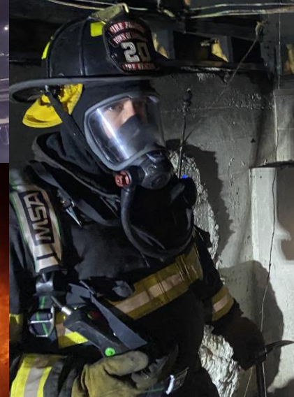
Chicago Ave Fire